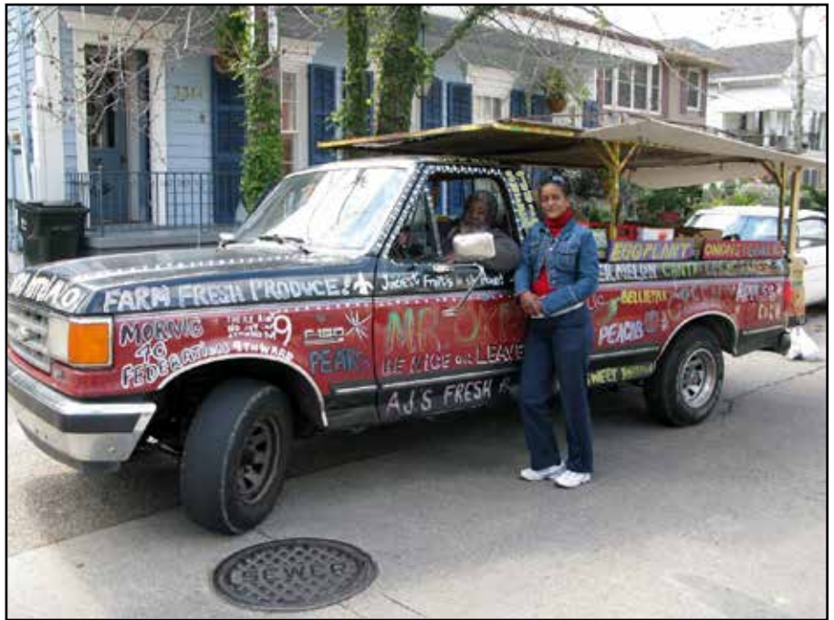
Mr. Okra, a mobile vegetable vendor in New Orleans, Louisiana.

Urban agriculture is defined as the “growing, processing, and distribution of food and other products through intensive plant cultivation and animal husbandry in and around cities.” 44 Sustainable urban farming can help address environmental and social impacts of industrial agriculture, while meeting some of the unique challenges presented by city life. Urban farms can revitalize communities, create green jobs and bring fresh food to areas where there is little available.