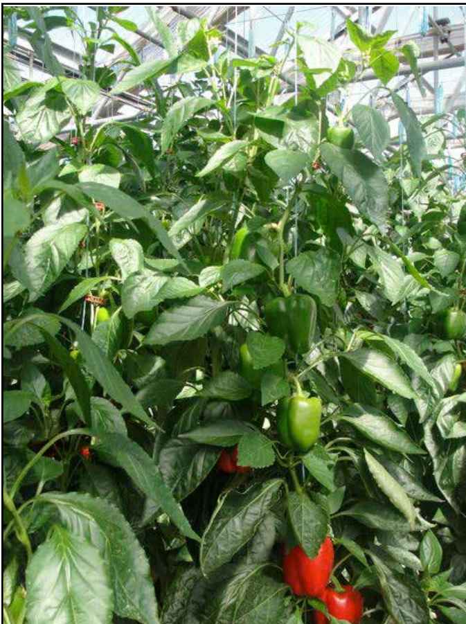
Peppers grow in a hydroponic greenhouse in Anguilla, in the Caribbean.

This transformation is necessary. Rising obesity rates, malnutrition and hunger, recalls on contaminated foods and environmental degradation are all signs that the industrial-scale, corporate controlled food system currently dominant in the United States is problematic. To meet the food needs of a growing population while protecting both human health and our planet, more sustainable ways to provide food must be employed. Recirculating farms meet that challenge.