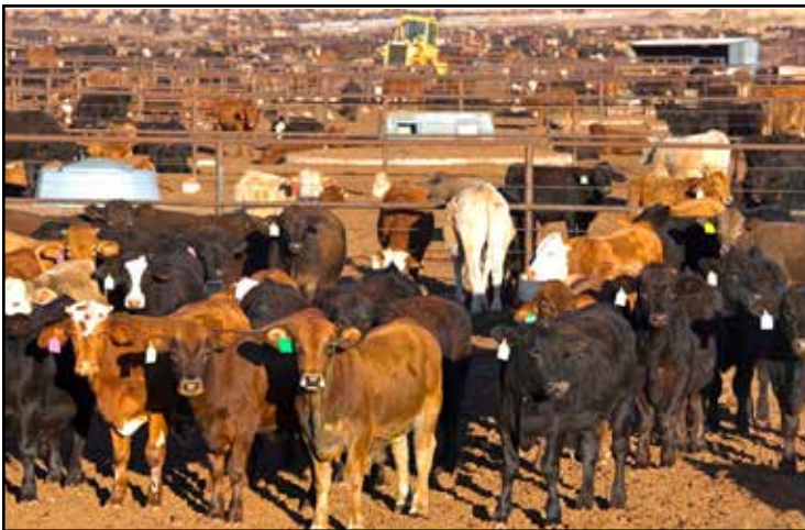
Cattle feedlot in Texas.

Industrial agriculture takes a toll on the environment. Thousands of acres at a time are often turned into plowed fields for a single crop, displacing wildlife and destroying biodiversity.