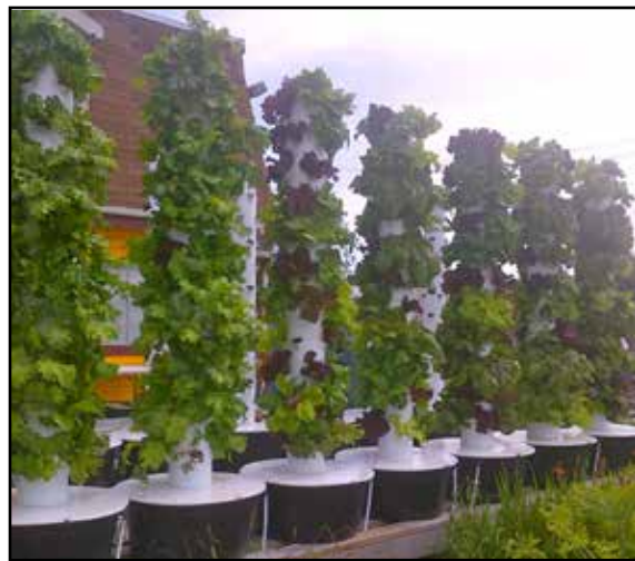
Aeroponic lettuce towers at Hollygrove Market and Farm in New Orleans, Louisiana.