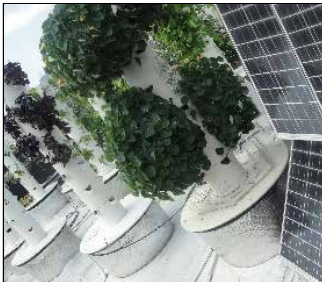
Aeroponic towers powered by solar panels on the roof of Bell, Book and Candle in the West Village, of New York City.