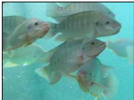
Pretty tilapia in a tank.

In most commercial aquaponic operations, the fish and the plants are held separate from one another with pipes or tubes connecting each growing area. Household sized and demonstration systems may use rafts of plants sitting atop the fish tanks allowing the roots to dangle directly into the water with the fish. 11 Many types of plants and fish can grow together. Tilapia is common because they can live in a wide range of pH levels. Yellow perch are also often grown commercially. 12 Leafy greens and herbs, which thrive on higher levels of pH, are common, but many plants grow successfully in aquaponics farms, including: tomatoes, cucumbers, peppers, beets, okra, cantaloupe, carrots, watermelon, squash, bok choy, seaweed, flowers and more. 13