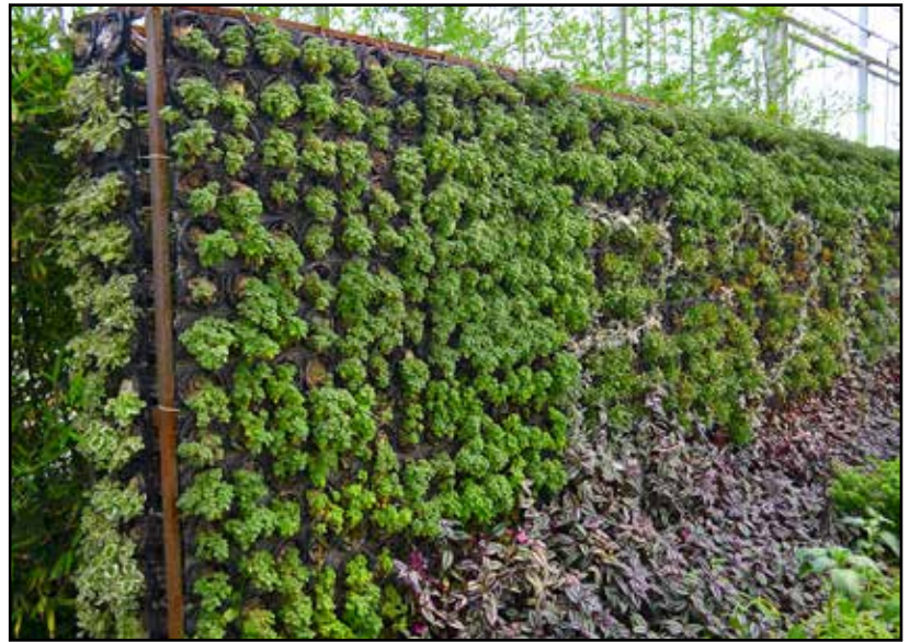
Hydroponic plant walls.

Although research and development in the fields of recirculating aquaculture, hydroponics and aquaponics has been ongoing for well over 30 years in the U.S., the current food system crisis sparked a flurry of activity and interest in recirculating farms recently as a way toward a healthier, more sustainable food culture. Farmers, entrepreneurs and researchers alike are continually improving on areas like fish feed and energy efficiency and developing new business models to incorporate both social and economic considerations. Below are just a few examples of innovations taking place in this rapidly expanding industry.