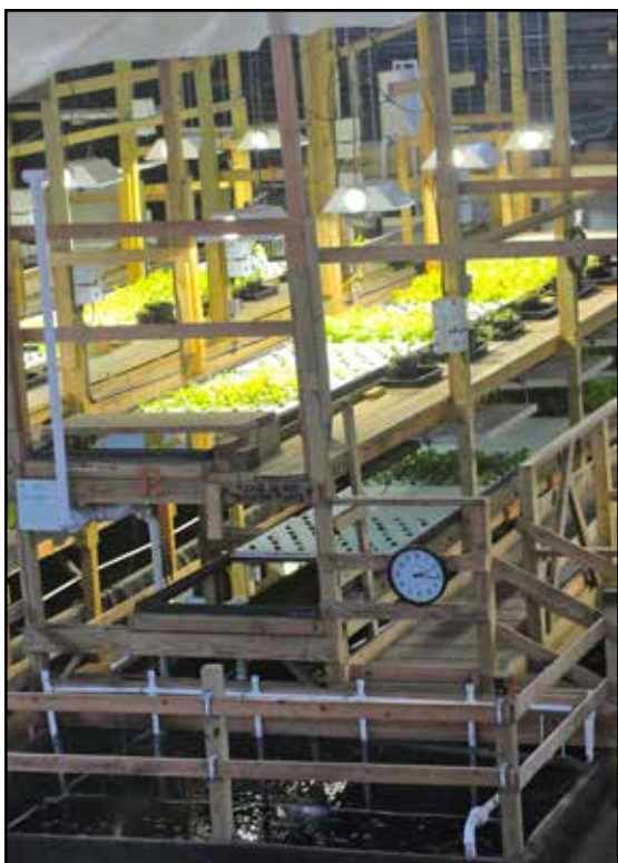
Aquaponics system at Sweetwater Organics – an aquaponic farm in Milwaukee, Wisconsin.

Power in Wisconsin, to name just a few, are all examples of farms that open up their doors to those eager to learn.