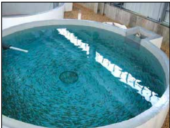
Fish tank.

Recirculating Aquaculture Systems (RAS) raise fish in tanks or some other similar structure and use a water filtration system to continuously “clean” the water for reuse. This is comparable to an aquarium set-up. Water circulates from the fish tank to a series of filters that remove fish wastes and uneaten feed and return clean water to the tank. 5 There are many types of fish, both freshwater and saltwater, being raised successfully in RAS, and the list is constantly expanding. Tilapia, yellow perch, eel and striped bass are common freshwater fish in RAS, while seabream, shrimp, oysters, crabs, branzini (Mediterranean seabass), cobia, and black seabass are all raised in saltwater RAS. Ornamental fish such as koi, and even goldfish, are popular too.