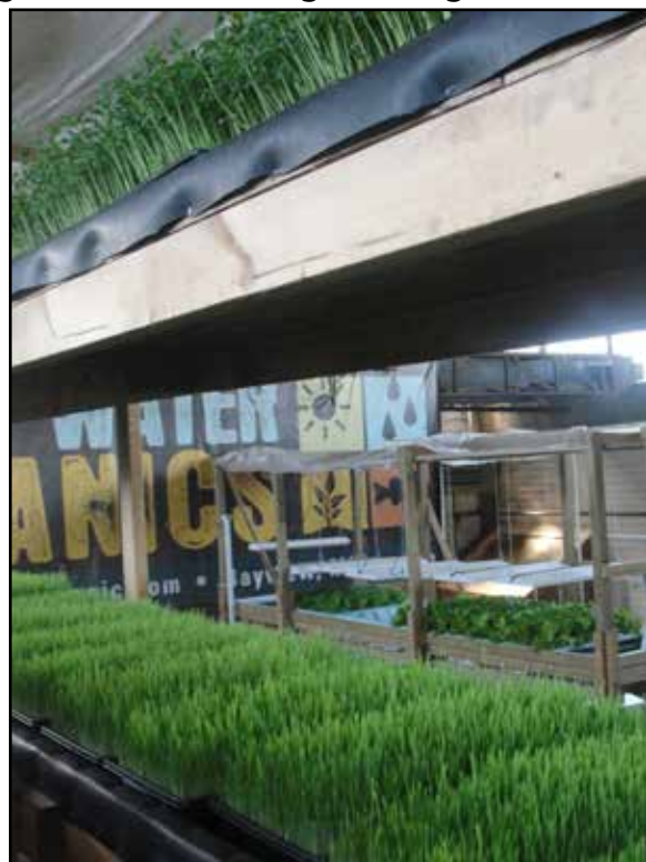
Wheat grass growing indoors at Sweetwater Organics – an aquaponic farm in Milwaukee, Wisconsin.

Recirculating farms are also in use as a means to revitalize neighborhoods and contribute healthy fresh affordable food where it is otherwise scarce or inaccessible for various reasons. For example in New Orleans, LA in areas recognized as food deserts, communities both on the West Bank of the city and out East are building aquaponic farms, that turn empty or overgrown lots into edible green spaces. These beautify the surroundings as well as provide healthy fruits, vegetable, herbs and fish to the neighborhood, and sometimes beyond. In addition to supplying fresh food to their own community, the Mary Queen of Vietnam Community Development Corporation sells their food commercially for profit. Even when the primary focus is on increasing local food security by consistently supplying affordable healthy fresh food in underserved areas, recirculating farms can provide economic benefits to their farmers.