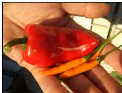
Red bell pepper and carrots in hand from Boswyck Farms, a hydroponic garden in Bushwick (Brooklyn) New York.

Numerous varieties of plants and fish can be grown in recirculating farms. Here is list of what farmers are most commonly reporting to grow successfully either in personal use or commercial settings – and by no means is this list exhaustive! 54