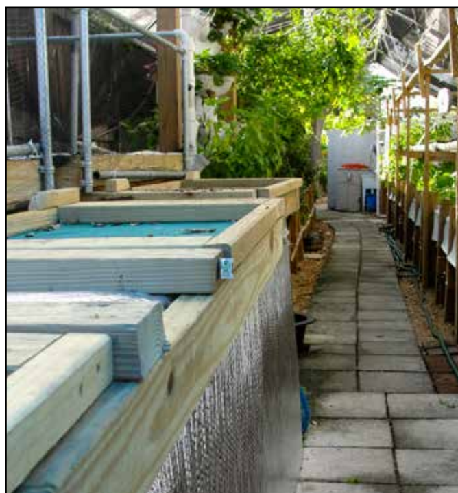
Aquaponic farm behind a strip mall in Winter Park, Florida – Sahib's Aquaponic Produce.

Consumers, farmers and policymakers alike all have a role to play in supporting the development of recirculating farms. Consumers can demand sustainably produced foods and seek out businesses that carry products from recirculating farms or even start a farm in their own backyard or community. Farmers can work together to share ideas and innovations, to pool resources and to more deeply integrate themselves into a regional food hub. And policymakers can help incentivize the growth of the recirculating farming industry by supporting research and development and shifting subsidies from industrial agriculture and aquaculture to recirculating farms. Working together, we can make a real change.