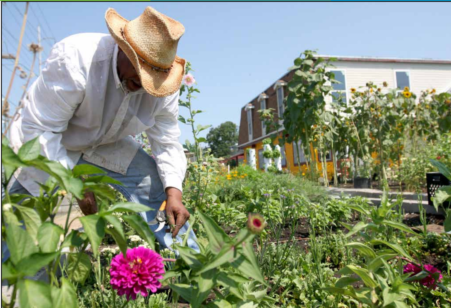
Farmer at Hollygrove Market and Farm in New Orleans, Louisiana.