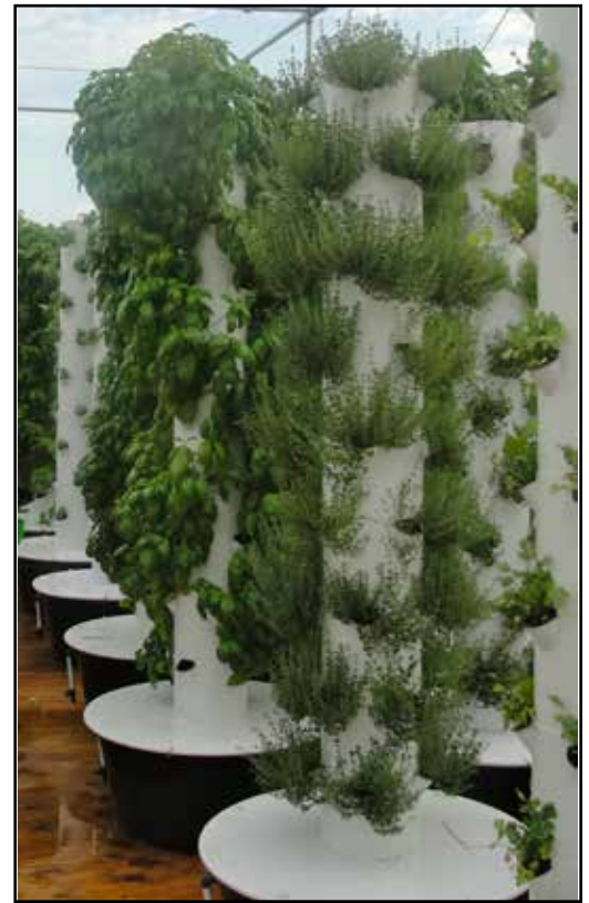
Aeroponic towers on the roof of Rouses Supermarket, Baronne Street, New Orleans, Louisiana.

Urban farms can introduce new sources of fresh, healthy food for such food-limited communities, functioning in place of or in addition to grocery stores. Building strong local food systems increases access to a wider variety of products and benefits urban and rural communities alike.