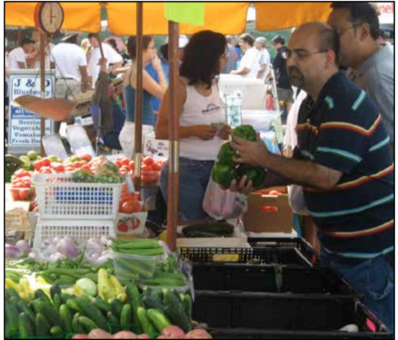
Sankofa Farmers Market, New Orleans, Louisiana.

How people relate to food defines their food culture. It encompasses everything from how they eat – whether grabbing a hamburger on the run or taking the time for a sit-down meal with family and friends – to how and where their food was produced. A healthy food culture nourishes both people and our planet. Our food culture relates to our social environment too – can nutritious food choices be made easily and is there a diversity of farming techniques used within a robust regional food system? It includes an agricultural economy that drives green job growth and connects communities both in rural and urban areas.