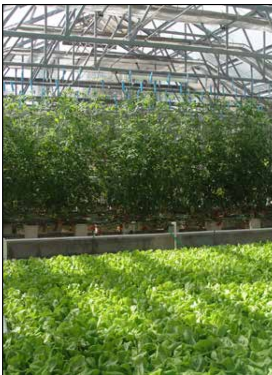
Hydroponic lettuce and other vegetables and herbs grow in a hydroponic greenhouse in Anguilla, in the Caribbean.

At the University of the Virgin Islands Agricultural Experimentation Station, an outdoor aquaponics system, they control caterpillars by introducing bacteria that only deters the caterpillars. Growing fish and plants together may also introduce some beneficial bacteria to the root systems of plants that make them more resistant to common plant diseases. 64 This combination of producing more food with less waste and pollution as well as an avoidance of chemical pesticides makes recirculating farms highly eco-efficient.