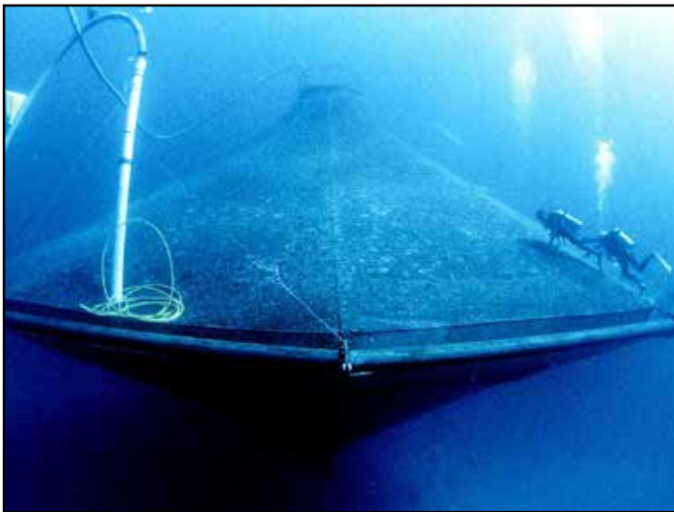
Open ocean aquaculture cage with divers, photo courtesy of NOAA library: http://www.photolib.noaa.gov/index.html .

Just as recirculating hydroponics and aquaponics can be used as sustainable methods of growing vegetables, fruits, herbs flowers and other plants, recirculating aquaponics and aquaculture systems can be employed as a way to raise fish in an eco-friendly and humane manner. Recirculating fish farms are fully contained, unlike open water fish farms that raise fish in floating net pens or cages in the ocean, rivers or other bodies of water, where fish wastes, excess feed, antibiotic and chemical treatments and parasites and diseases pass directly into the surrounding environment. Recirculating farms capture and often reuse waste, recycle water, can better control the environment for the fish – drastically reducing the incidence of