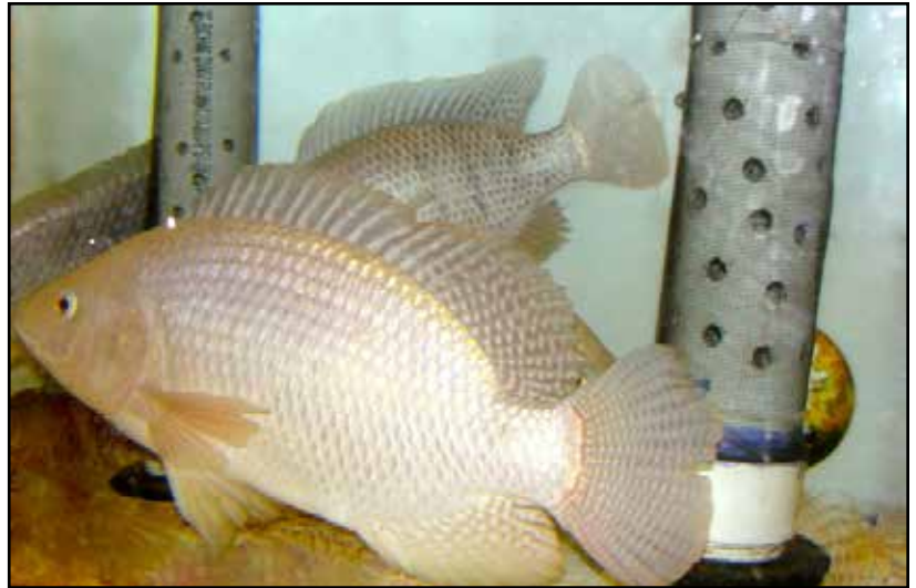
Tilapia swim in a tank in the basement of The Plant, an indoor urban farm housed in a repurposed meat packing building in Chicago, Illinois.

crabs, sea bream, branzini, cobia, red drum, black seabass, bivalves (oysters, mussels, clams), soft corals, assorted flatfish (like flounders), lobster, nautilus, rainbow trout, striped bass, assorted shrimp and prawns and even salmon. 88