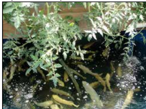
Fish and plants in Colorado Aquaponics' system at the Grow Haus, in Denver Colorado.