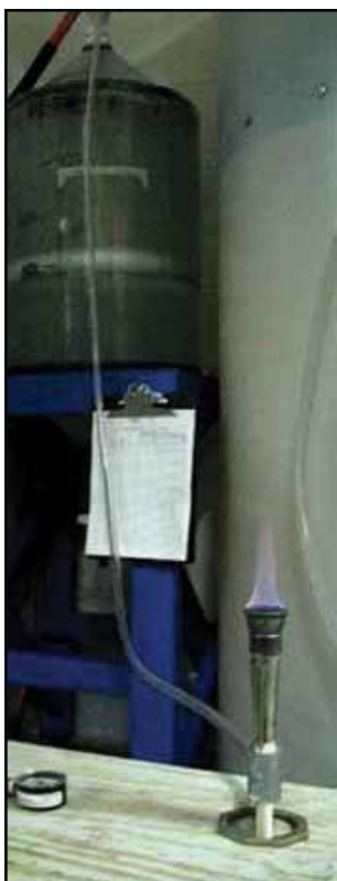
Methane flame generated from repurposed fish waste from a recirculating aquaculture system in Baltimore, Maryland.

running pipes carrying water from the farm through black plastic sheets that transfer the heat they absorb from the sun to the water in the pipes. Using this method, the farm had temperatures between approximately 70° F and 77° F in the winter when air temperature was not above 60° F. 72 Using solar heating has been found to reduce conventional energy requirements by 66 to 87 percent, depending on the regional climate where the recirculating farm is located. 73