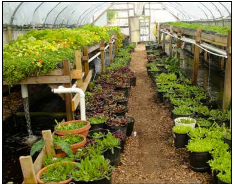
Aquaponics system at Growing Power in Milwaukee, Wisconsin.

Recirculating farms can also be integrated with traditional farming techniques. For example, Growing Power, in Milwaukee, WI, uses aquaponics as part of a larger "community-food-hub" that produces everything from produce to honey to soil through composting. 87 Scalability, space efficiency and low-cost make recirculating farms a viable solution to increasing the availability of healthy, fresh food.