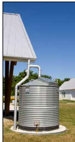
Large rain catchment.

In comparison to other agriculture techniques, much less water is needed in recirculating farms to produce the same amount of food. For