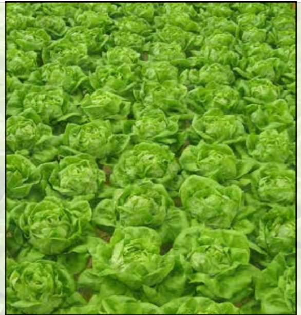
Aquaponic Bibb lettuce growing at Natural Green Farms in Racine, Wisconsin.

Across the country, conversations about food are changing. Rising obesity rates, frequent scares about contaminated food and environmental degradation have made it abundantly clear that our reliance on industrial agriculture is unsustainable. While one of six people living in the United States struggles to put food on the table, vast amounts of fresh produce are lost daily due to spoilage during the often long trek from farm to table. Fast food and the highly processed meal options lining grocery aisles are calorie rich, but nutritionally poor, and can leave us heavier but less healthy. The pervasive use of pesticides and chemical fertilizers can poison our environment and may be causing increases in cancer and a number of diseases. The system is broken – and we know it.