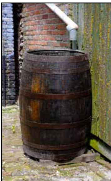
Single barrel used to catch rainwater.

example, it is estimated that a head of lettuce grown through soil-based agriculture requires 15.9 gallons of water. At the University of the Virgin Islands Agricultural Experiment Station mentioned above, they can produce one head of lettuce with only 7.6 gallons of water – nearly half the amount of that needed in soil-based growing. And the water in the UVI system is being used to produce another product at the same time – fish. This system requires a daily water addition of 1–1.5% of the total system's volume. 79