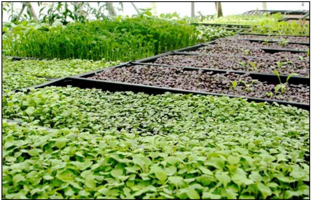
Microgreens growing at Cabbage Hill Farm Foundation, a non-profit farm with an aquaponic greenhouse in Mt. Kisco New York.

By growing food using continuously cleaned and recirculated water in place of soil, in closed-loop systems, innovative farms can produce food in previously unthinkable spaces, and do so in an array of shapes and sizes. This technology is opening up the door for both urban farming and a rural renaissance, moving back toward smaller scale family farming – just about anywhere – and allowing more food to be grown in an environmentally and economically sustainable way.