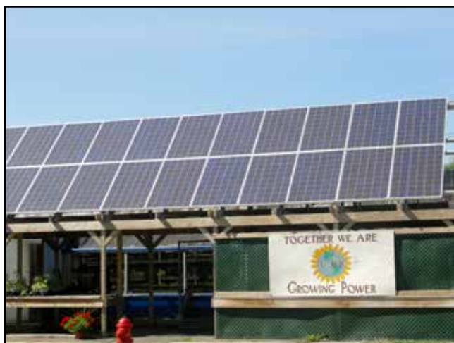
Solar panels atop Growing Power, in Milwaukee, Wisconsin.