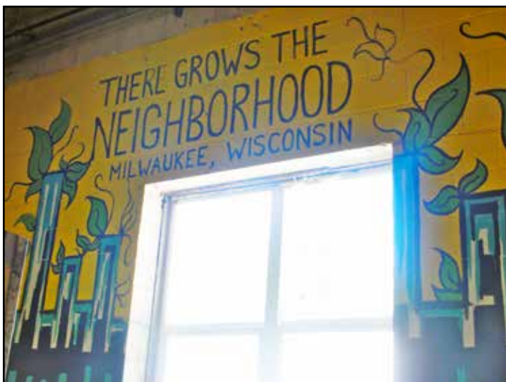
There Grows the Neighborhood mural at Sweetwater Organics – an aquaponic farm in Milwaukee, Wisconsin.

Indoor recirculating farms can help to meet the demand for fresh produce and fish, year-round. Because indoor farms are not constrained by the weather, farmers can time their harvests to meet out-of-season demand and switch crops during times of high supply or competition from other agriculture, providing opportunities for better prices. They may also increase revenues through organic certification. Currently, the demand for organic products at the retail level is outpacing the supply. 102 Hydroponic and aquaponic farms could help fill this gap.