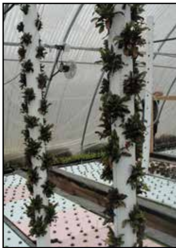
Aeroponic towers at Clearwater Farms (now Olde Forge Farm) in New York .

One innovative form of hydroponics is vertical farming, called aeroponics. Aeroponic systems are particularly well-suited for growing a large amount of produce in a small space, because plants grow vertically, arranged on tube-like structures or in cascading baskets or buckets, minimizing the ground space needed. The roots of the plants hang into the center of the tube (or bottom of the baskets/buckets) where water flows or sprays intermittently through the middle, dispensing measured amounts of the nutrient-filled water directly onto the roots. Excess water drains to the bottom and is collected, then recirculated through the system. This method maximizes the amount of oxygen getting to the roots of the plants, helping them to absorb more nutrients. 4