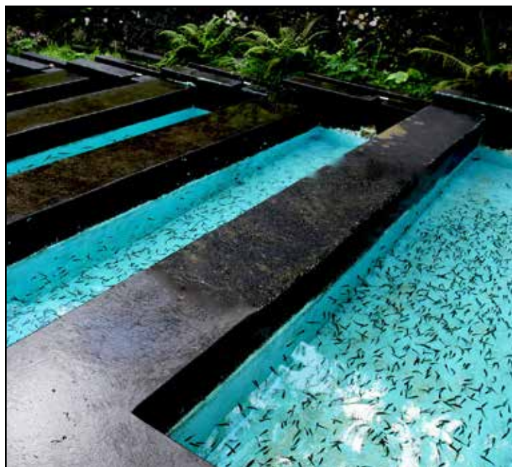
Freshwater aquaculture .