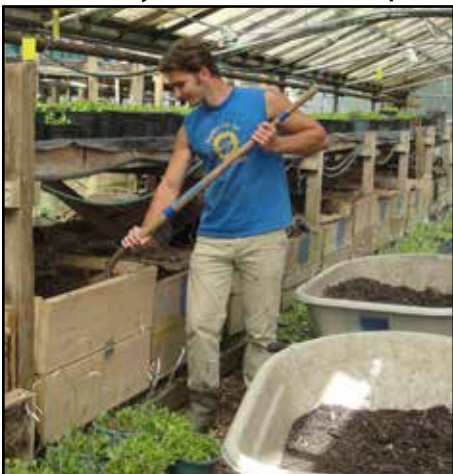
Creating soil through vermi (worm) composting at Growing Power in Milwaukee, Wisconsin.

In Brooklyn, NY, for example, the largest-to-date rooftop garden (100,000 square feet) is being built to showcase hydroponics in an industrial waterfront revitalization effort. The farm will create jobs, produce local food and assist with storm water management – helping to control as much as 1.8 million gallons of storm water. 86