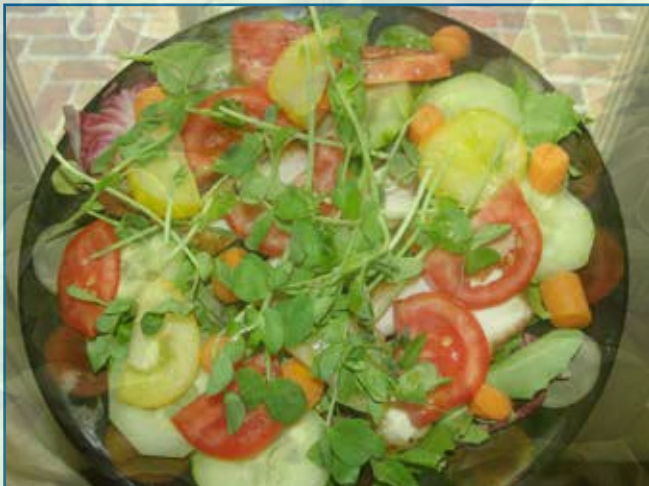
Recirculating farm salad - most of the vegetables were grown using hydroponic and aquaponic techniques.

The transformation of our food system is needed to feed a growing population without depleting resources for future generations.