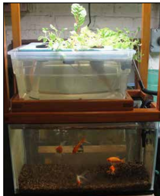
Mini aquaponic system.

Contributing to the eco-efficiency of aquaponics systems is that use of most chemicals is highly discouraged by design. Pesticides that treat plants could contaminate the water, killing the fish. Any drugs used on the fish – for example to enhance their growth or to combat parasites and diseases – could similarly harm the growth of plants. When control is needed, natural methods of pest and disease management can be used, like a natural predator system (sometimes called integrated pest management), where another organism is introduced into the system, creating traps and barriers to keep certain pests out.